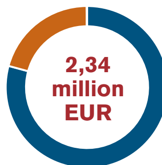
USE OF FUNDS