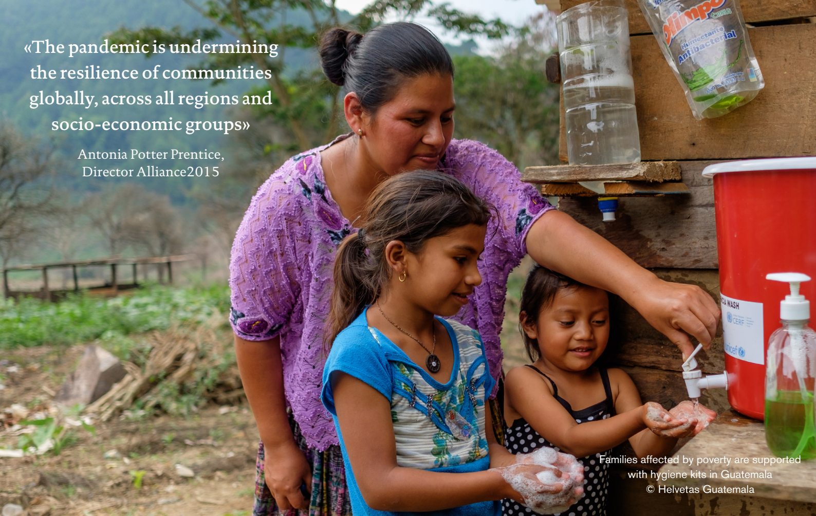
Families affected by poverty are supported with hygiene kits in Guatemala