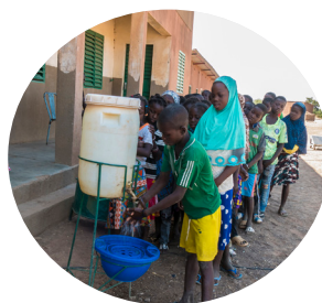
A student demonstrates proper hand washing under the guidance of the teacher