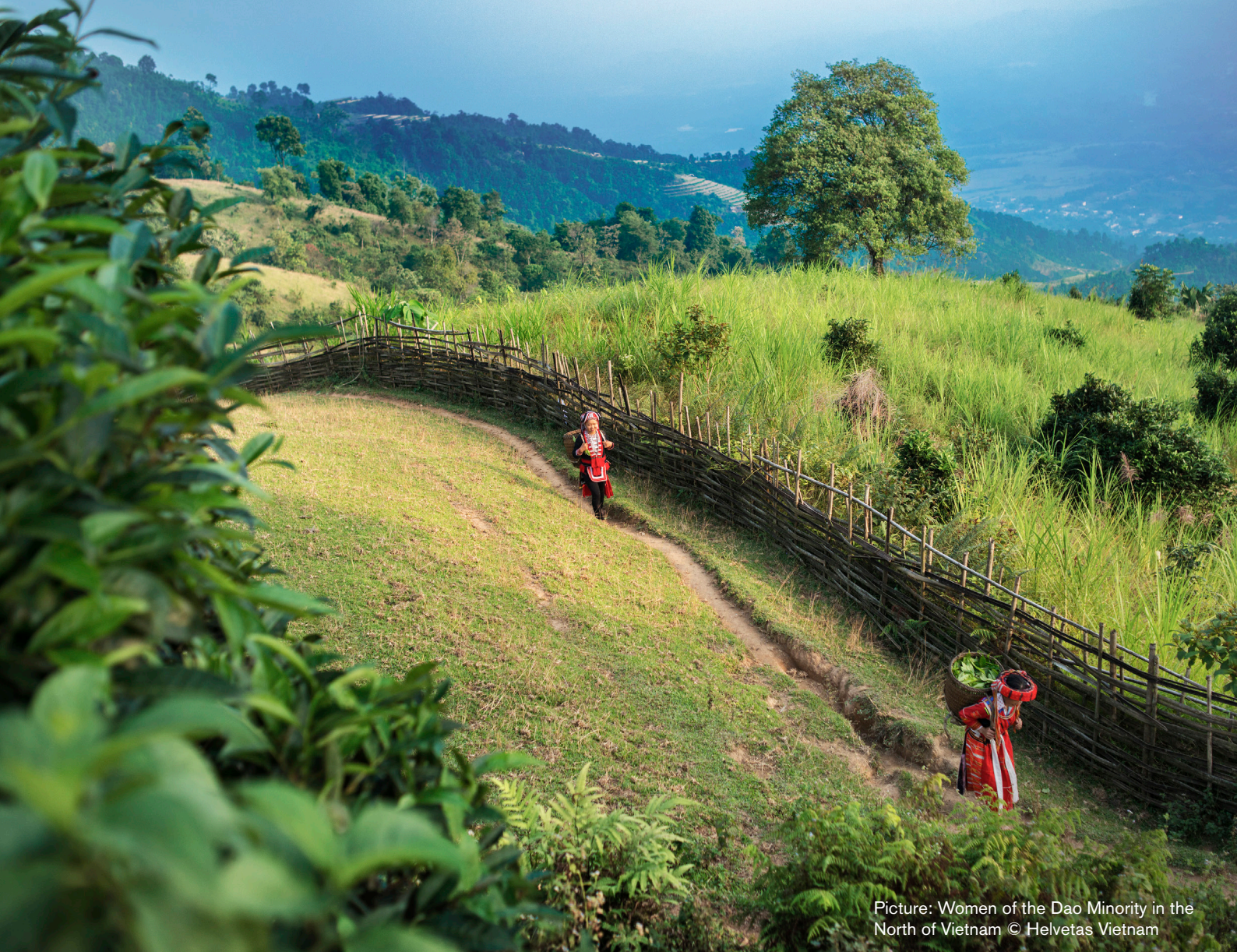
Picture: Women of the Dao Minority in the North of Vietnam