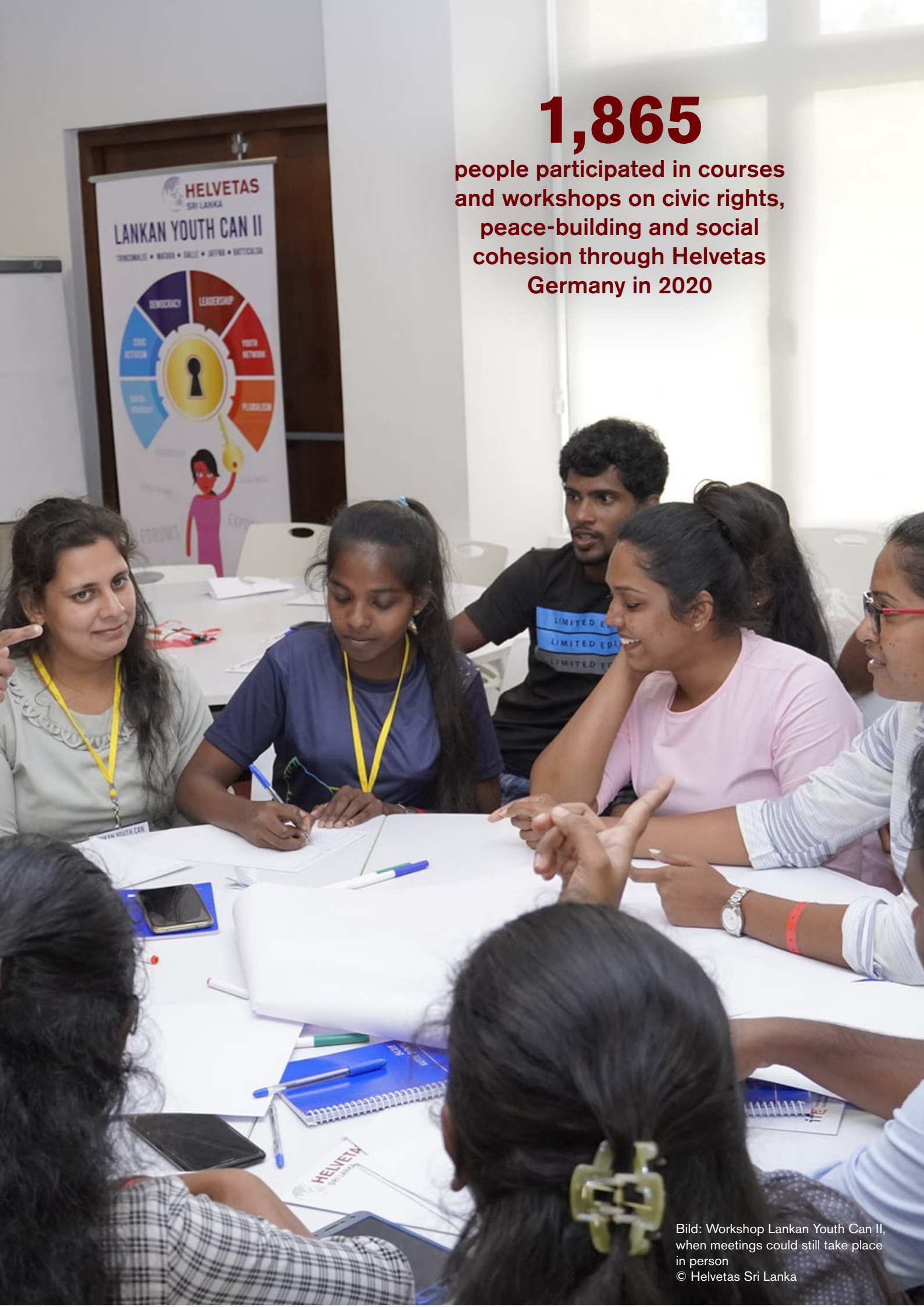
Bild: Workshop Lankan Youth Can II, when meetings could still take place in person © Helvetas Sri Lanka

people participated in courses and workshops on civic rights, peace-building and social cohesion through Helvetas Germany in 2020