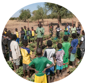
Access to water in schools allows the school classes to grow vegetables.

In the province of Gnagna in eastern Burkina Faso, access to safe water and sanitation remains a challenge. Nearly 89% of households do not have a latrine, and half of elementary schools do not have a water point. Women, girls and especially children under 5 years pay the heaviest price in this situation. Diseases related to lack of hygiene represent almost a third of the recorded illnesses. Malnutrition, which is also one of the consequences, affects more than one in three persons. Since January 2016 Helvetas has been working with the town councils and local organizations in the municipalities of Manni and Coalla to support improving the health and quality of life of the population.