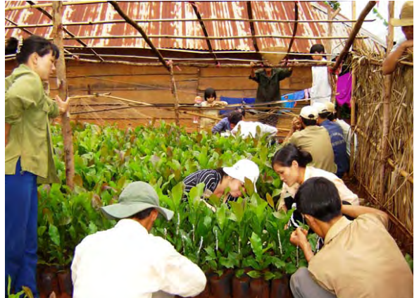
Learning by doing (FFS) is the best way to share experience among the farmers

FFS is a learning platform between a group of farmers and an extension worker. The extension worker facilitates the experience sharing between farmers. FFS have been introduced in the three provinces since 2004. Extensionists were trained in FFS through a comprehensive cascade concept from provincial to district to commune/village levels. In each province, a provincial core group of 15 staff from diverse backgrounds and institutions (extension centers, forestry department etc) have been trained and gained competent in FFS methodology, facilitation skills and learner