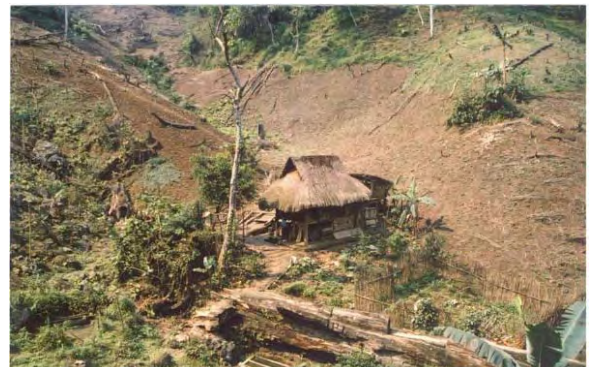
Poverty rate in the uplands is still high due to lack of access to different services.

Therefore, ETSP has worked through the governmental institutions to improve local planning and extension methods/approaches, and improve linkage between research, education, training and extension for a better provision of services to address the needs of remote, upland farmers.