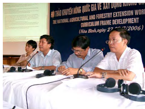
NAEC workshop on the development of extension curriculum standard

With support of ETSP, the National Agriculture Extension Center collected all existing extension methods and approaches and formulated the Concept Note on Curriculum Standard for Training Extension which become the reference training frame for all provincial extension centers. In this curriculum standard, methods and approaches supported by ETSP (CFM, FFS, PTD, marketing, etc.) were included. The curriculum standard consists of a 'fixed' part, and a 'soft' part which can be flexibly adapted by the provinces suitable to their conditions. This is in line with the gradual shift of centralized state extension to a bottom-up extension system.