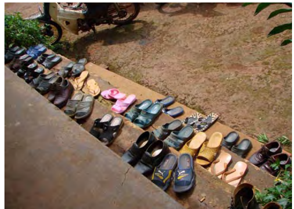
Participation at all levels: joint planning and decision making are entry keys for the success of ETSP