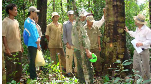
It is the first time the farmers could discuss what to do with their forest (picture taken in Dak Nong)

The results of the village development planning showed a strong need for decentralized multi-stakeholder forest management. To support gradually a change from top-down to a bottom-up management system, ETSP introduced the community forest management approach to the three provinces. It started with a TOT training cycle on CFM for key stakeholders from provincial and district authorities. During the three training modules, participants from partner provinces were familiarized with theoretical concepts and procedures necessary for CFM introduction at village level.